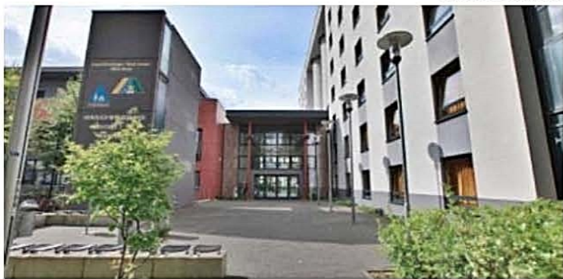
DJH Jugendherberge Köln-Deutz