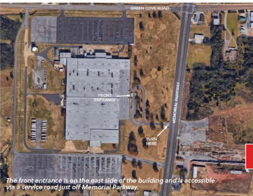
The front entrance is on the east side of the building and is accessible via a service road just off Memorial Parkway.

If you have any questions or additional accommodations, please contact your primary point of contact (POC). Alternatively, you may call the front desk at 256-882-4800.