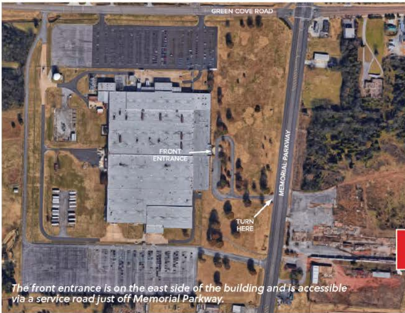
The front entrance is on the east side of the building and is accessible via a service road just off Memorial Parkway.

If you have any questions or additional accommodations, please contact your primary point of contact (POC). Alternatively, you may call the front desk at 256-882-4800.