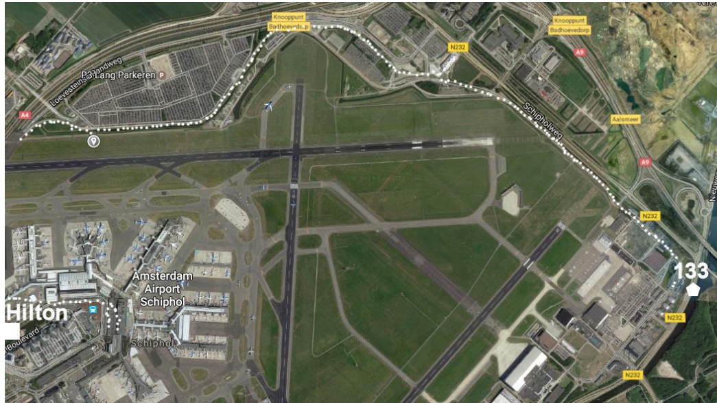
Picture of the area and bus route from the airport to Building 133